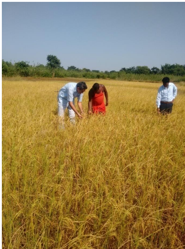
FLD field of Paddy at maturity stage

variety, though it was drought year. It indicates that variety “SahbhagiDhan” can perform better over local variety even in draught condition also in mid and upper lands.