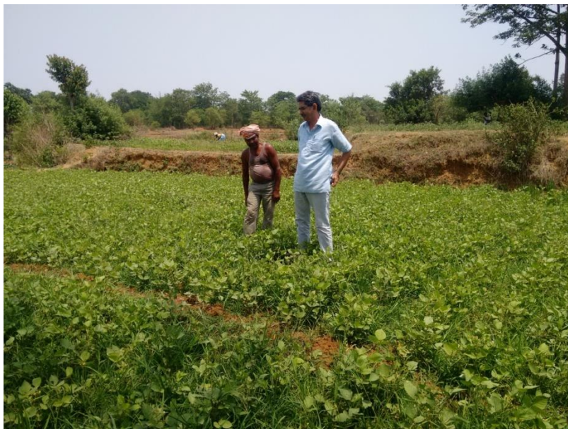
CFLD field of Green gram

During summer 2018, total 25 demonstrations were conducted on summer green gram and found that Green gram variety IPM 2-3 performed better and given 88.9% more yield over non demonstration having local variety.