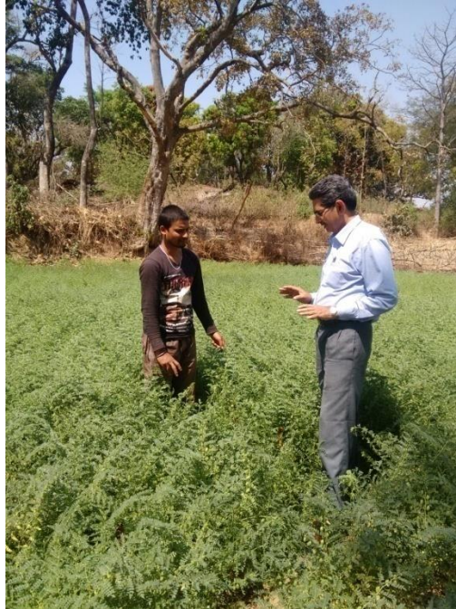
Demonstration field of Chickpea

During summer 2018, total 25 demonstrations were conducted on summer green gram and found that Green gram variety IPM 2-3 performed better and given 88.9% more yield over non demonstration having local variety.