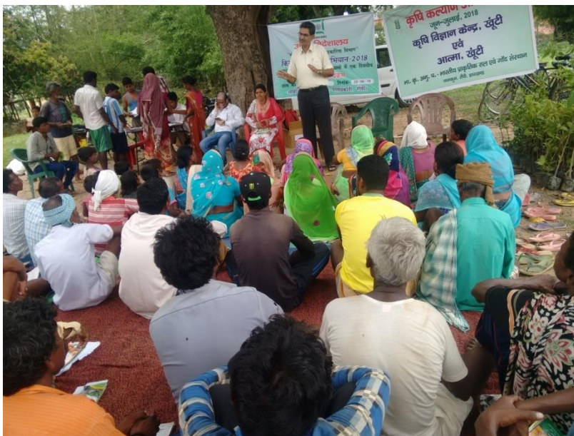
Training of farmers

Under “Krishi KalyanAbhiyan-I” a three day’s On Campus training of 50 farmers of 25 villages of Khunti district was conducted on “Scientific Lac Production” on June 4-6, 2018 at venue “Krishi Bhavan, Khunti”. During Krishi KalyanAbhiyan-I (June 1 to August 15, 2018), total 75 Off- campus training to 6790 farmers belonging to 25 villages of Aspirational district “Khunti” was given on Vermi-composting (870 farmers), Kitchen Gardening (1630 farmers), Lac Production (1510 farmers) and Plantation Technology of Fruits and Vegetable crops (2500 farmers)